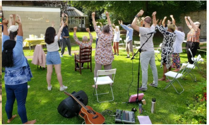
Outdoor exercise at a BEMSCA social event organised by University of Bath Action Project Team 2023