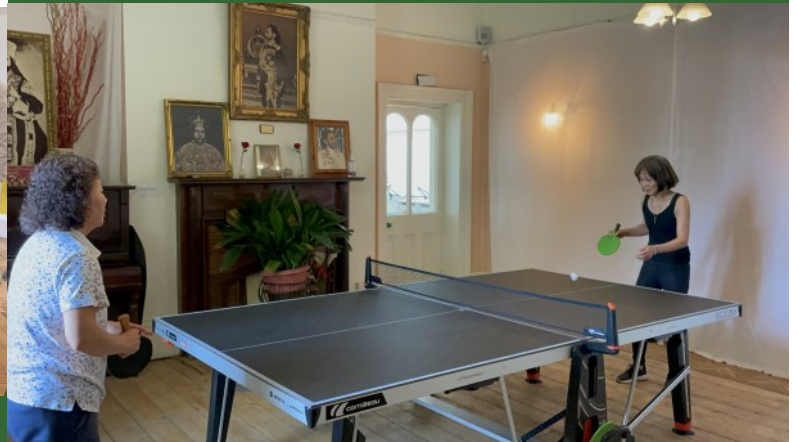
Table tennis with Partis College every Thursday annual event April 2024