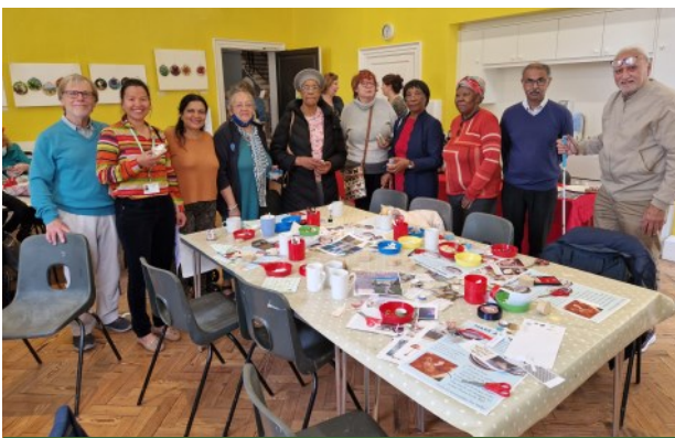
BEMSCA staff and members attend World Mental Health Day at The Holburne Museum.