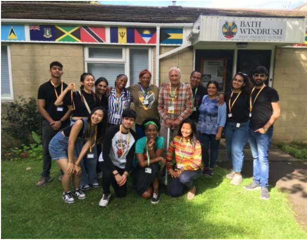
University of Bath students on completion of the Action project which centred on wellbeing and mindfulness